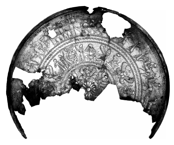
Figure 3 Fragment of Phoenician silver dish from Amathus (southern Cyprus), c.750–600 BC. The decorations, arranged in concentric circles, show a variety of scenes comparable with the illustrations on Achilles' shield: see esp. the siege of a city on the outer ring. (British Museum, BM 123053)

If it is correct to see the warfare on the shield as a milder or more conventional style of conflict than the war dramatised in the Iliad , that supports the deletion of the macabre lines 535-8: see n. there.